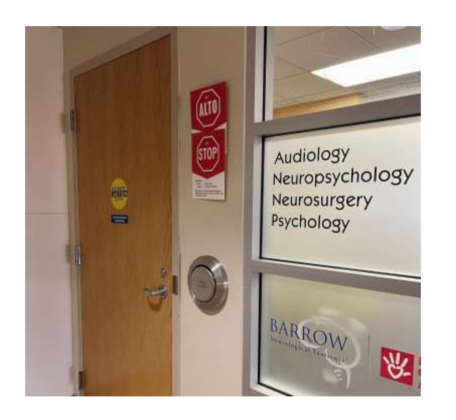
Let's go into clinic!

It is important to get your ears checked to make sure you can hear well as you get older. The people who check your ears are called audiologists. This book will show you the steps for your appointment to get your ears checked.