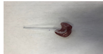
1) Put the new earmold with the long tubing into your child's ear