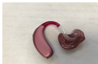
6) Attach the trimmed earmold to the hearing aid.