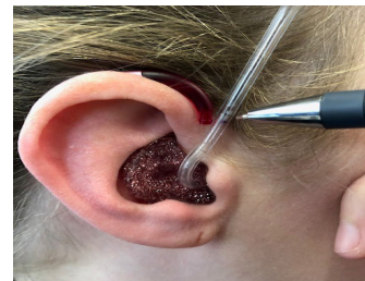
4) Use a pen to mark the tubing