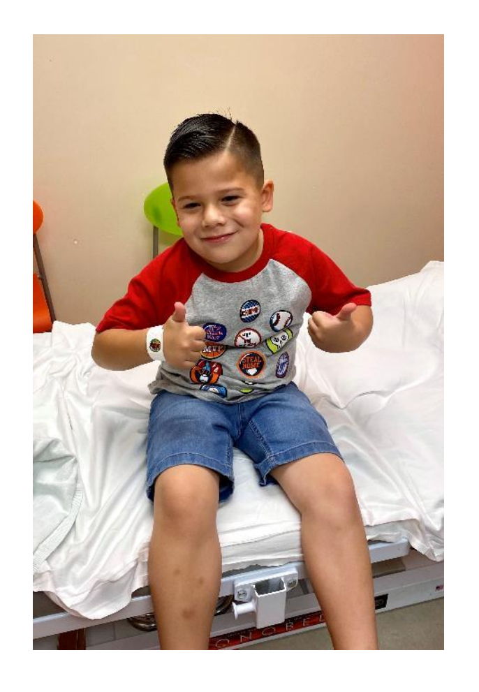
Way to go!

Your echo is finished! It's time to change back into your shirt. The sonographer will bring you to a different room in the clinic for your appointment with the doctor.