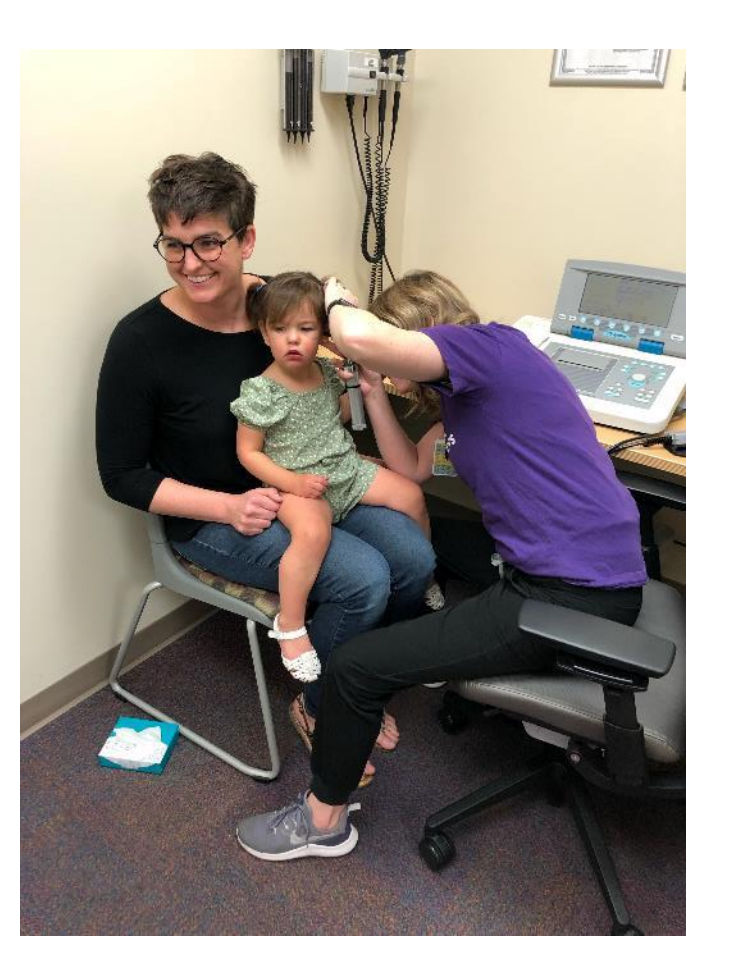
You can sit by yourself or with your grownup.