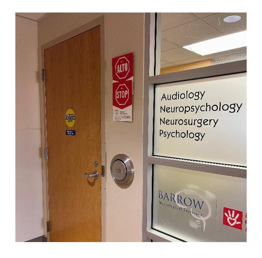
Let's go into the clinic!

It's important to get your ears checked to make sure you can hear well as you get older. The people who check your ears are called audiologists. This book will show you two kids getting their ears checked by an audiologist.