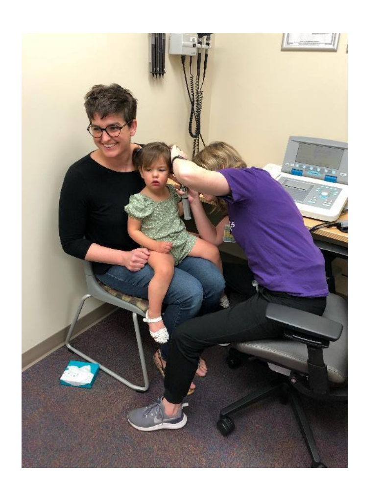
You can sit by yourself or with your grownup.