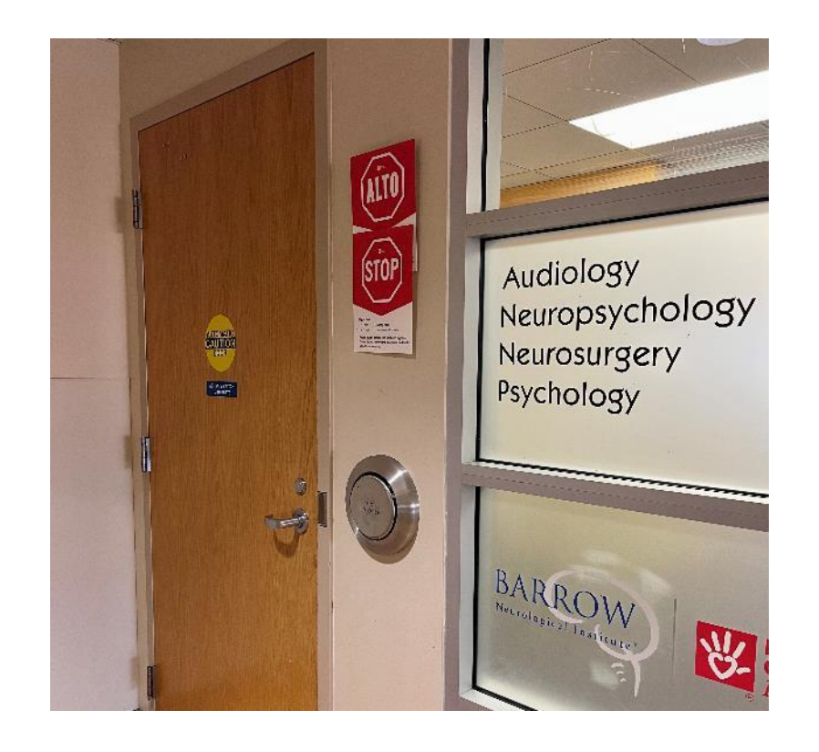
Let's go into clinic!

It's important to get your ears checked to make sure you can hear well as you get older. The people who check your ears are called audiologists. This book will show you two kids getting their ears checked by the audiologist.