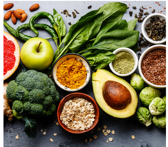
What we eat and drink can affect our bodies in good ways or in bad ways.

It is important to read food labels to be sure the foods you choose to eat each day provide the best nutrition for your physical, emotional, and mental health. Unfortunately, chemicals ( additives ) that are not healthy are often put into the foods we buy at the store to make them taste better, look better, or to make foods last longer.